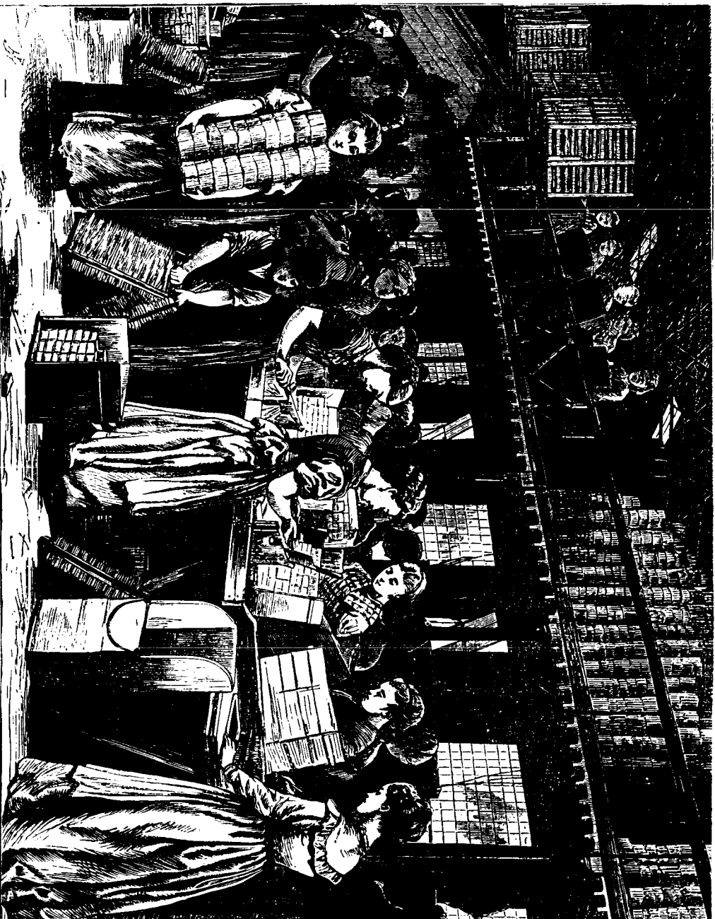
THE MATCH-MAKERS AT THE LAST-END