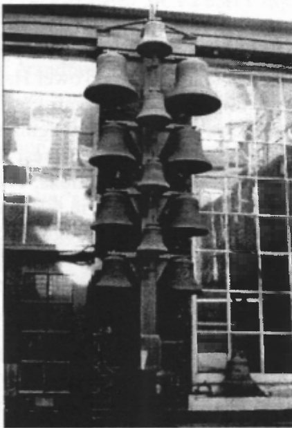
In the courtyard of the Whitechapel Bell Foundry

Available from Newham Parents Centre Bookshop, on the Barking Road, Eastside Bookshop, Whitechapel (next door to the Royal London Hospital), The Ragged School Museum Bookshop and W H Smiths, among others.