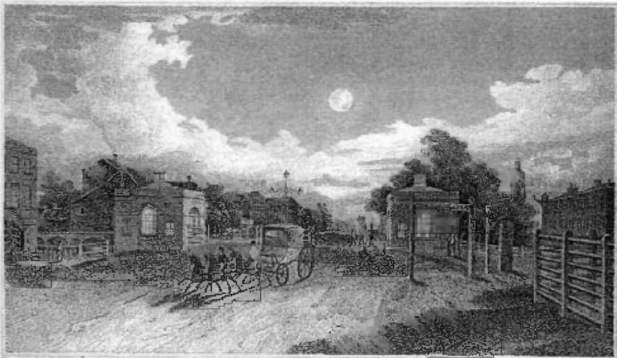
Entrance to London at Mile End (1808)