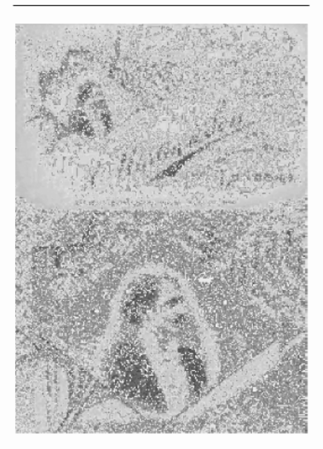
Photograph from Isaac Martin's studio, circa 1890 showing proprietor (enlarged below)