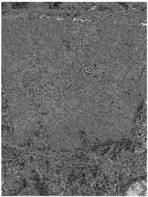
Grave with Chinese Inscription

(Philip advised: Venables had two shops, either side of Commercial Road (102-105 and 115 Whitechapel High Street). The building at 102-105 is still standing, the one at 115 has gone. They are listed as linen drapers, silk mercers, carpet warehousemen and house furnishers. Do any members remember using the Venables stores (almost opposite Gardiners)?