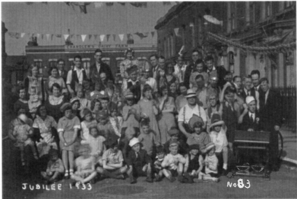
Jubilee Party in the East End for King George V and Queen Mary 1935 (not 1933 as it has been captioned!).