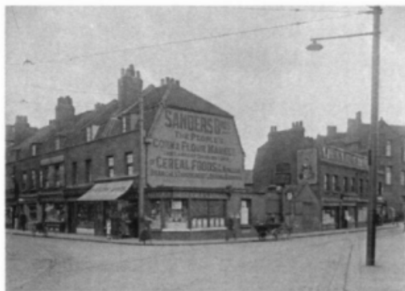
Sanders Bros Church Street, 1924