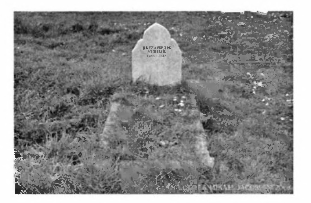
Elizabeth's grave in 2008, just before the Jacobson brothers cleaned dirt and grass from it.

He said: 'Maybe she felt that her relatives were visiting her?' At the cemetery they found an old spade and with it they cleaned dirt and grass from the grave. They also planted a small bush of red roses on it.