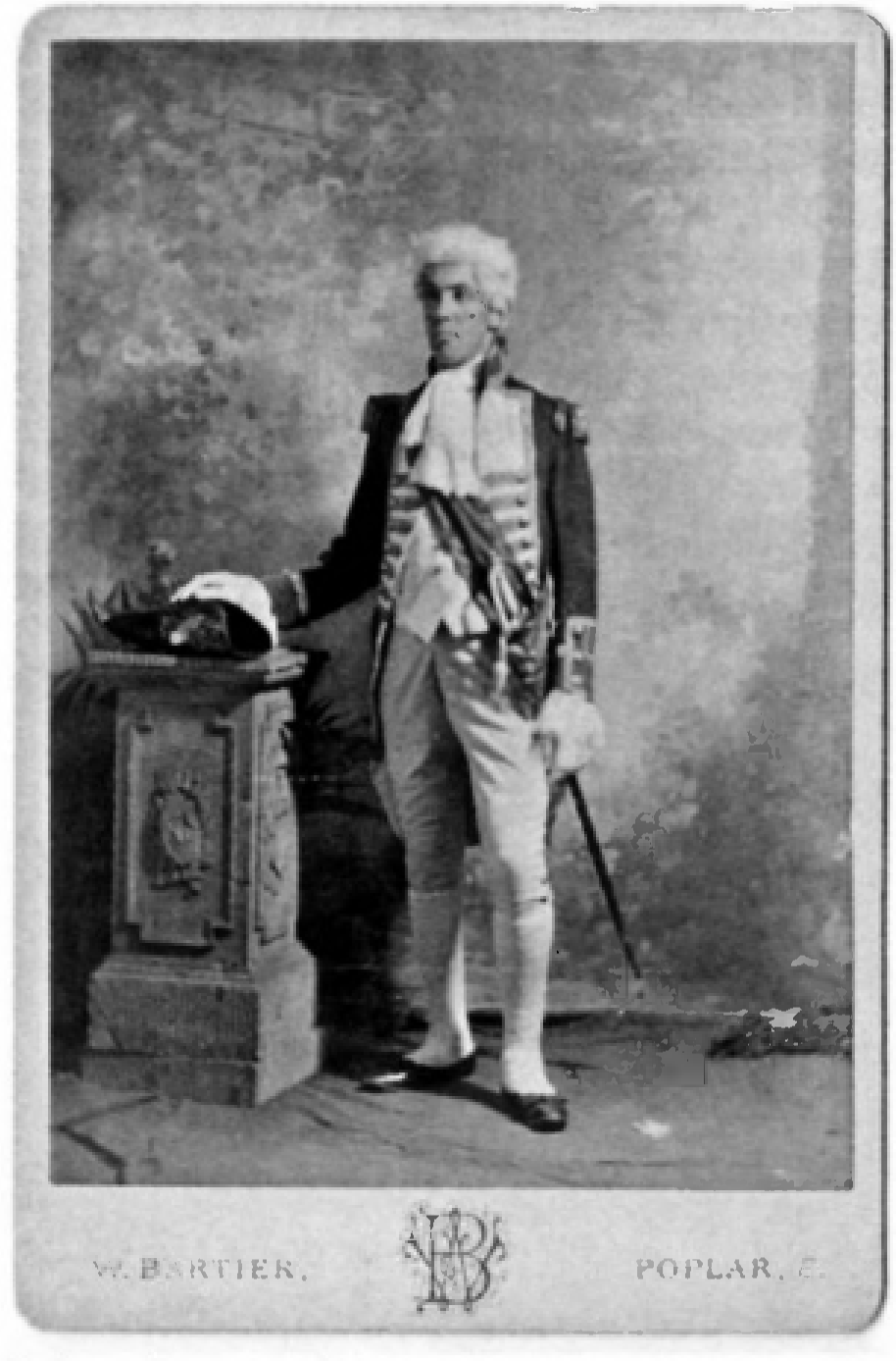
Cabinet size - actor?

site was covered by the usual grim block of flats, known as Westcott House.