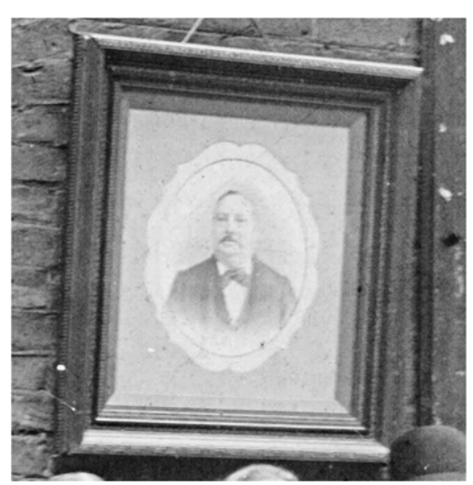
Photograph hanging on the exterior wall. Detail from the Brandon photograph.

For me, one of the most amazing things about this wonderful photograph is the large framed photographs hanging on the outside of the building at 112-114 Virginia Road. I have spoken to more than one person who knows about East End history, to ask is they have ever seen this before, and so far as I know, nobody has. The photo in the centre looks like