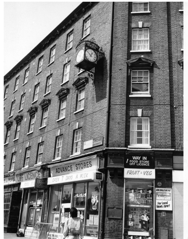
Minnie Lansbury Memorial Clock Bow Road