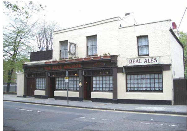
The Blue Anchor 2004

the other closed Bromley pubs I could still visualise and put them into the list below: in the order they came to mind.