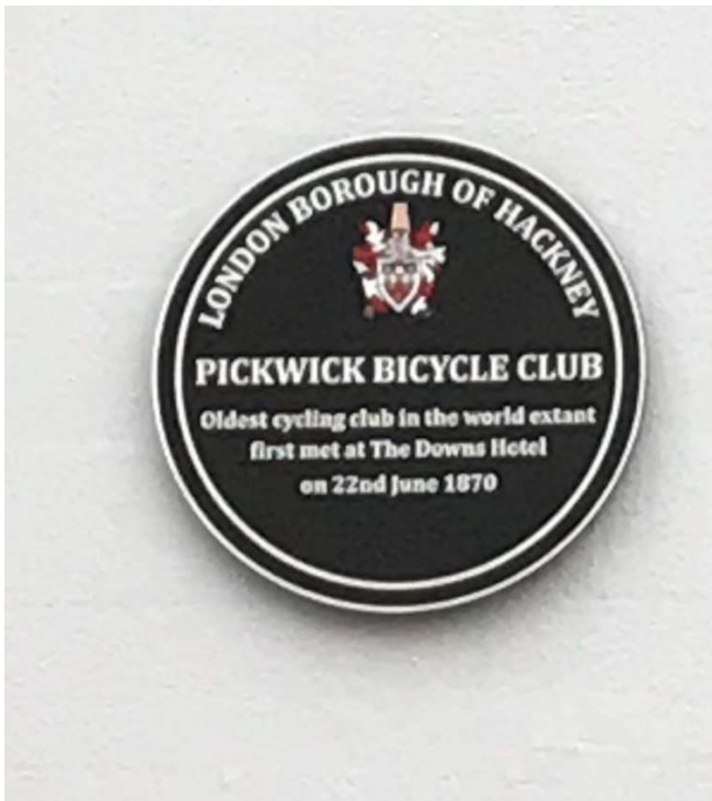
Pickwick Bicycle Club

This club is still going strong today and if you look on http://www.pickwickbc.org.uk/ you can find a wealth of information about the club, its history and look through some their old photos.