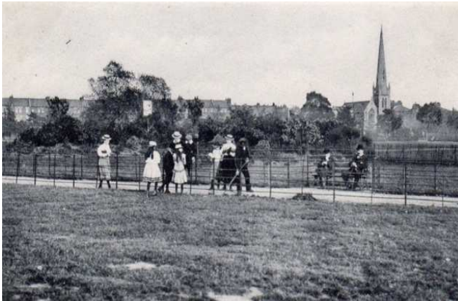
The Clapton Presbyterian Church is in the background of this postcard

photos that I have taken of the views as they are today.