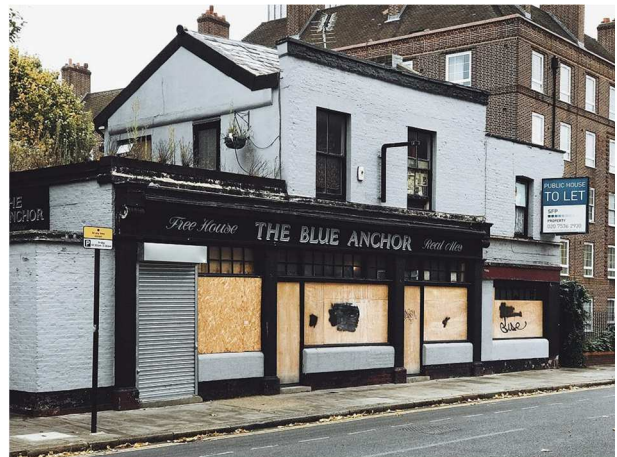
The Blue Anchor April 2019

Priory Tavern, Imperial Tavern Rose & Crown, Black Swan Bombay Grab, Widow's Sons Moulders Arms, Tenterden Arms Queen Victoria, Rising Sun Duke of Wellington, Seven Stars