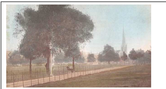
Clapton Presbyterian Church in the background