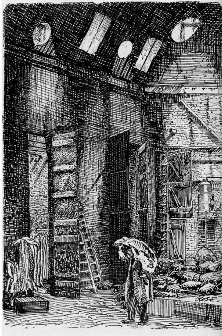
Erastus Rogers' Bacon Factory, Spitalfields (see page 3)