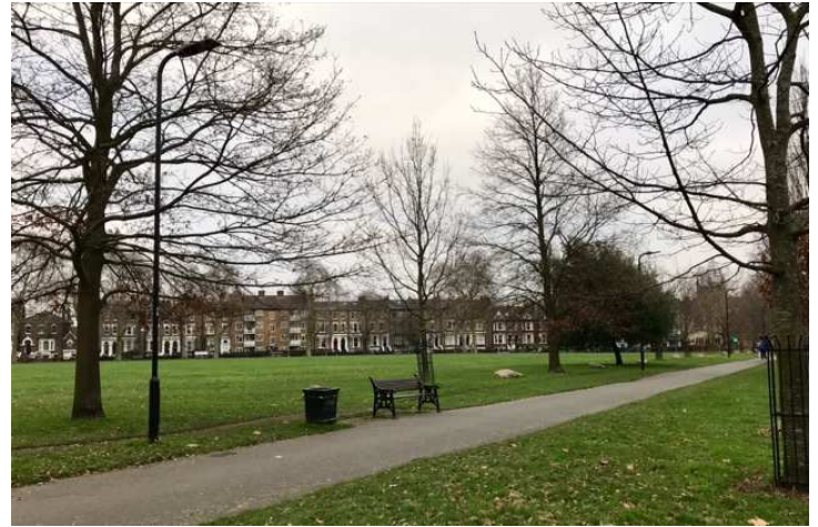
The same view today, but the church in the right hand corner is now called The New Testament Church of God (Pentecostal) and there is no spire on the church now as I assume that this went due to bomb damage in the Second World War