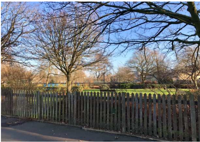
The same view today